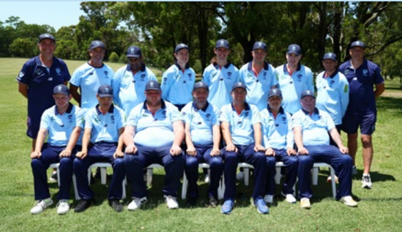
NSW Players with Intellectual Disabilities Team