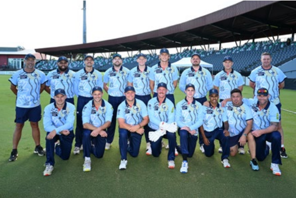
NSW Aboriginal and Torres Strait Islander Men's Team