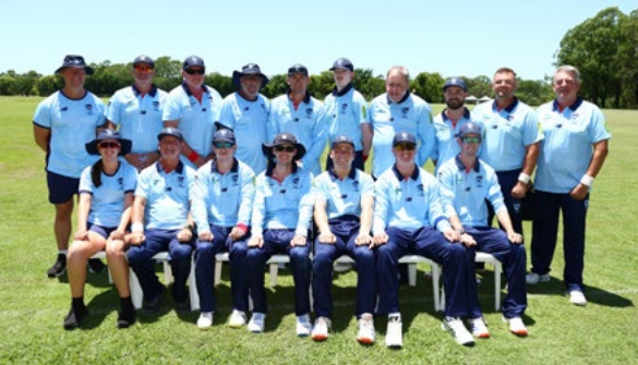
NSW Blind and Low Vision Men's Team