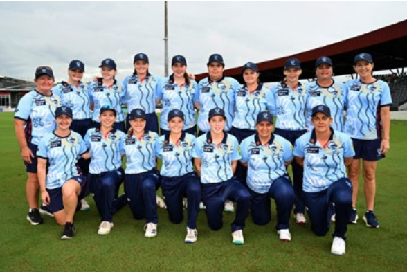
NSW Aboriginal and Torres Strait Islander Women's Team