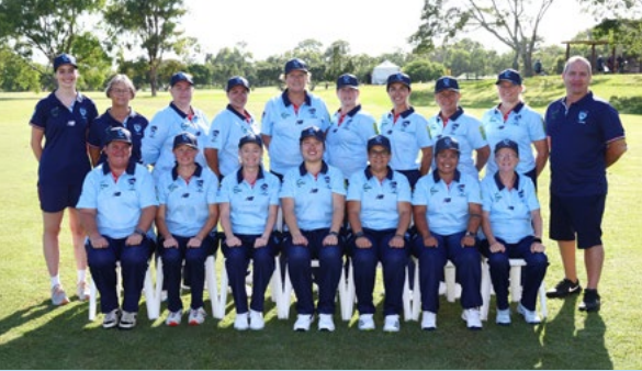
NSW Deaf and Hard of Hearing Women's Team