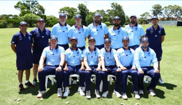
NSW Deaf and Hard of Hearing Men's Team